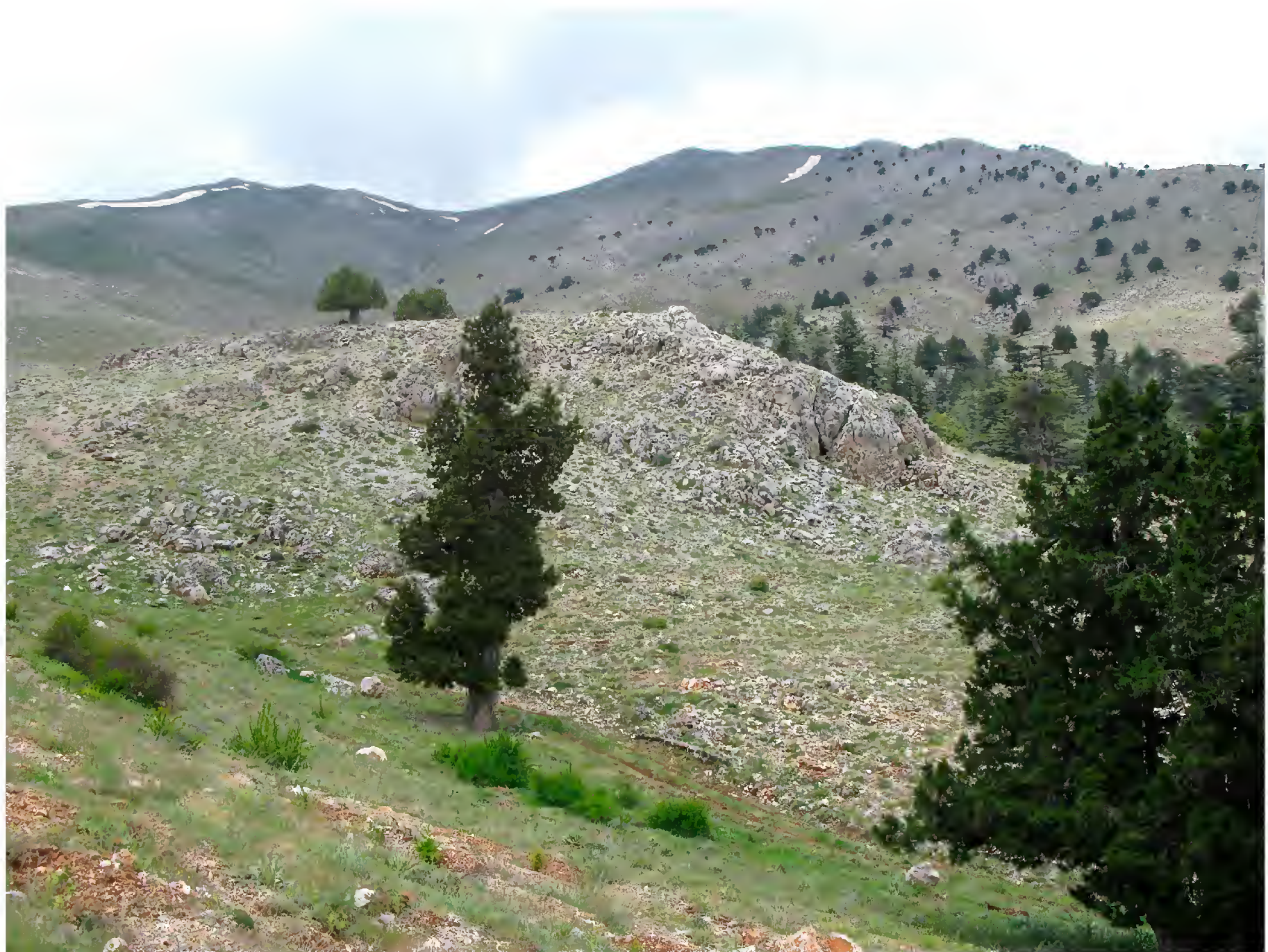
Fig. 3. Habitat of Dichorhinus geiseri sp. nov. in May in Ören, Turkey at 2421 m. a. s. l..

4 ♂♂, 1 ♀, same data as holotype (NMB); 1 ♀, “LIBYA 27.III.2005 Ras El Hilal P. Weill lgt.” (cRB).